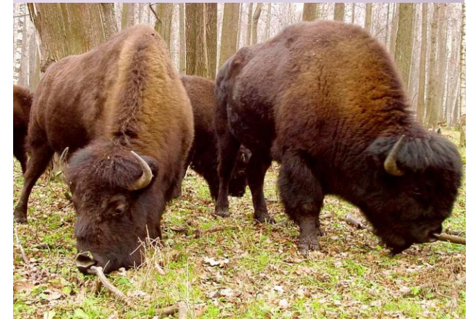
Only in Belovezhskaya Pushcha you can see aurochs (European bison)—unique animals of the planet