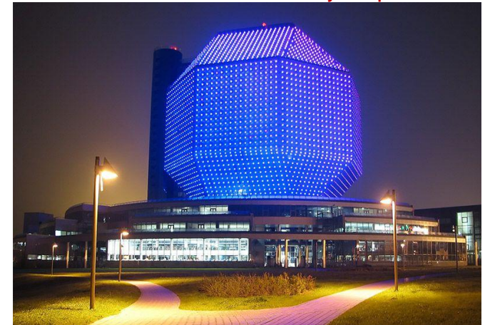
National Library of Republic Belarus